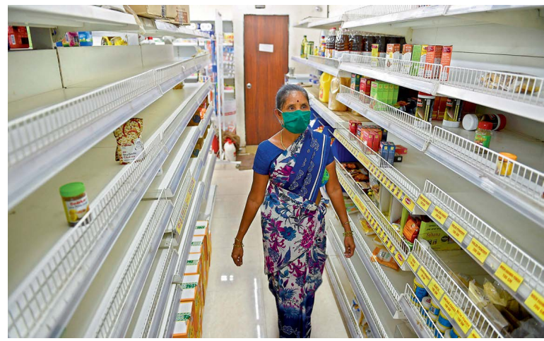
A woman wearing protective mask walks past near empty shelves of a supermarket at Sion in Mumbai on Wednesday during the nation-wide lock down in the wake of coronavirus pandemic. With several localities in Mumbai and surrounding areas sealed after coronavirus positive patients we found, the threat of community transmission of Covid-19 is looming large in the state.