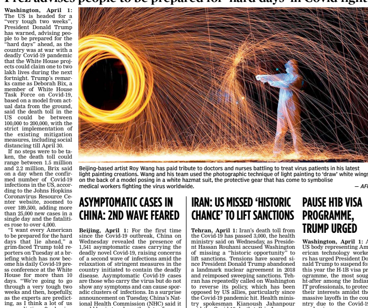
Beijing-based artist Roy Wang has paid tribute to doctors and nurses battling to treat virus patients in his latest light painting creations. Wang and its team used the photographic technique of light painting to 'draw' white wings on the back of a model posing in a white hazmat suit, the protective gear that has come to symbolise medical workers fighting the virus worldwide

Prez advises people to be prepared for 'hard days' in Covid fight