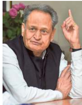
Rajasthan Chief Minister Ashok Gehlot

Bihar Chief Minister Nitish Kumar said the State had asked for 10 lakh N95 masks but received only 50,000. After seeking five lakh PPE