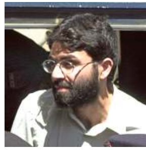
Omar Saeed Sheikh, the main accused, was among the three released by India after the Kandahar hijacking.

The main accused, British-Pakistani Ahmed Omar Saeed Sheikh who was on death row for the murder, was found guilty of a lesser charge of kidnapping and sentenced to seven years in prison and a fine of ₹2 million to be paid to Pearl’s widow and his orphaned son,