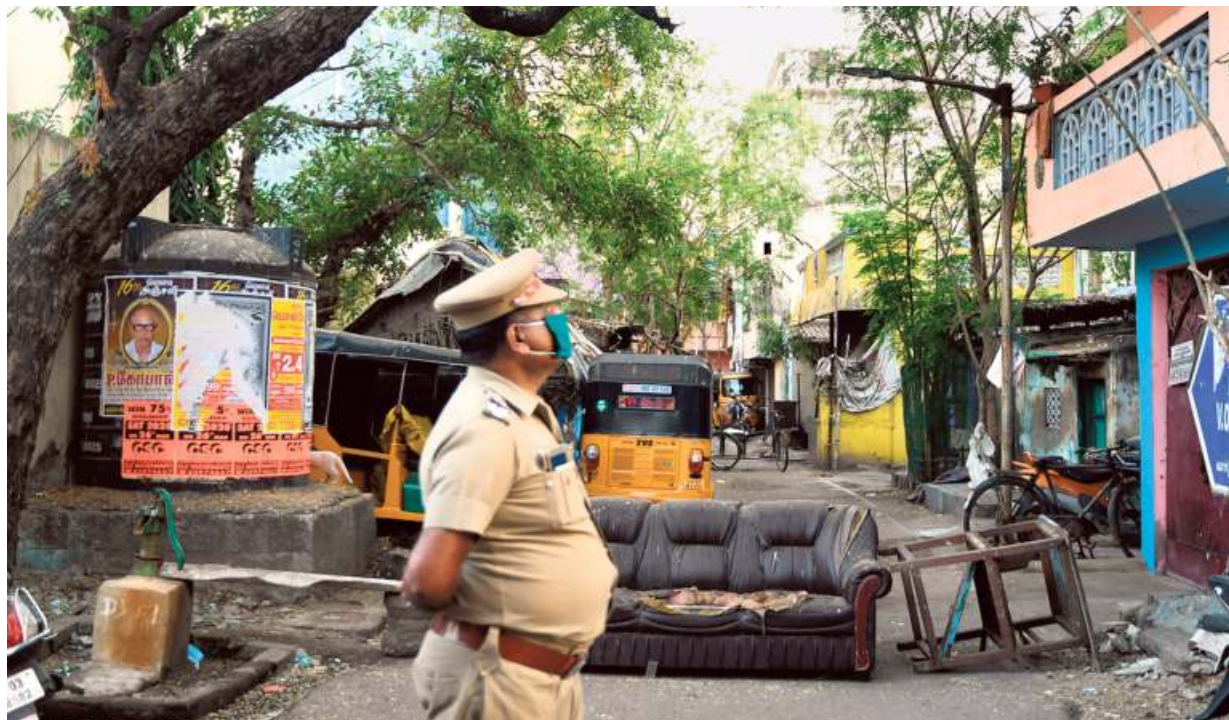
Far and wide: A locality at Tondiarpet in Chennai was quarantined after a few residents who reportedly attended the Nizamuddin conference were taken away for testing by the authorities on Thursday.

129 more from the sect’s headquarters test positive; 2 died on Thursday