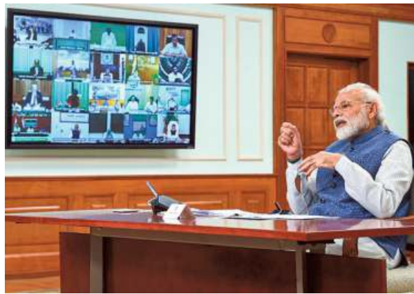
The way forward: Prime Minister Narendra Modi interacting with Chief Ministers via video conference on Thursday.

In his opening remarks, he emphasised that the sup-