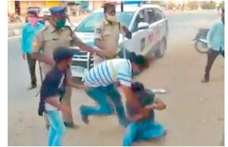
Cops thrash a man at Wanaparthy as his son tries to stop them.

He also sought release of funds to import Personal Protective Equipment (PPE) to safeguard the field staff dealing with Covid-19 cases.