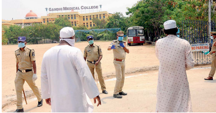
People stopped outside Gandhi Hospital after security was beefed up following the attack on a doctor on Thursday. — DEEPAK DESHPANDE