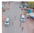
Aerial view from drone

The Cyberabad police started using Drone cameras for surveillance in the communities during the lockdown period. The high-resolution cameras can fly at a height of 400ft and record the movements of the public. The cameras provided by Cyient company also have an additional feature of thermal screening, however, it is not being used by the police, and the current purpose of use is only to record lockdown violations in order to keep a check on the errant persons who are violating the lockdown rules. The Cyberabad police started using the drone-based surveillance. The technology helped the police to monitor the situation in by-lanes and densely populated areas. The drones are equipped with cameras, thermal imaging payloads and a sky speaker for public announcements. The cameras help in providing real-time situations on the ground and take the necessary steps to address the incidents.