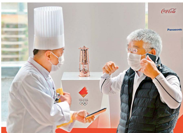
People wearing face masks stand in front of the Olympic Flame which was passed from Tokyo 2020 to Fukushima Prefecture at the J-Village National Training Centre in Naraha town on Thursday.

Lausanne, April 2: The postponement of the Tokyo Olympics and the shutdown of the sporting calendar because of the coronavirus pandemic are going to hit international sports federations hard financially. Many sports that are part of the Games depend heavily on the payouts every four years from the International Olympic Committee (IOC). "The situation is tense and very gloomy. An assessment will be made, but clearly some posts are under threat," said an official of a major international federation. The 28 international federations (IF) of the sports that were due to be present at the Tokyo Olympics, would have received substantial sums from the IOC. However, the postponement of the Games until 2021 could lead to a freeze check. "In this communication, Harrison claimed he himself will be taking a 25 per cent pay cut for at least the next three months. The pandemic is absolutely challenging the sport has faced in the modern era although the full extent and impact of the pandemic on cricket is as yet unknown, it is already clear that it will be extremely significant," wrote Harrison. With its reserves going down to £11 million in 2019-19 from 73 million pounds in 2015-16, a cricket-