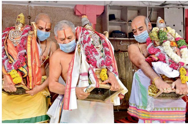
Priests wearing masks bring out the idols of Lord Rama and his consort Sita for conducting a wedding ritual as part of the Rama Navami celebrations at a closed temple in Hyderabad on Thursday. Most temples in Telangana and Andhra Pradesh have performed the wedding ritual without the presence of devotees.