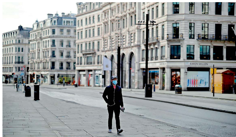
A pedestrian wearing a mask as a precautionary measure against Covid-19, walks past closed-down shops on an empty Regent Street in London on Thursday, as life in Britain continues during the nationwide lockdown to combat the pandemic.

Spain reported its biggest monthly increase in jobless claims on record and the US expected to reveal more massive job losses. Since emerging in China in December, Covid-19 has infected more than 940,000 people — including at least 500,000 in Europe — and claimed more than 47,000 lives.