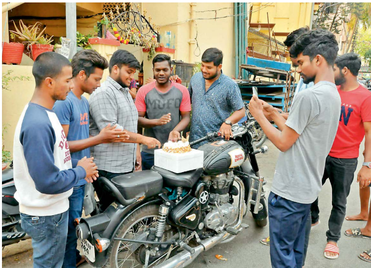
Youngsters cut cake at a birthday celebration in Ashoknagar during lockdown in Hyderabad on Thursday.