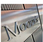
Global rating agency Moody's investors Service on Thursday said it expects deterioration in Indian banks' asset quality due to pressure on profitability and capital.

Global rating agency Moody's investors Service on Thursday said it expects deterioration in Indian banks' asset quality due to pressure on profitability and capital. It said if the government makes more capital injections in public sector banks, as it had in the past few years, it would mitigate capital pressure for