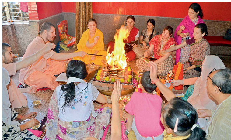
Devotees perform rituals on the occasion of Ram Navami at Vrindavan in Mathura on Thursday during a nation-wide lockdown in the wake of coronavirus pandemic. Amid chant of 'Jai Sri Ram', thousands of devotees assembled in temples in various parts of West Bengal on the occasion of Ram Navami on Thursday, giving a thumbs down to social distancing norms prescribed by the government during the lockdown period.