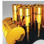
Crude oil prices soared over 30 per cent on Thursday after US President Donald Trump tweeted saying he had spoken to Saudi Arabia and expected Saudi and Russia to cut their supplies by 10 million barrels per day.

However, later Russian news agency Sputnik reported that Kremlin spokesman Dmitry Peskov had refuted Trump's claim about a phone conversation between Putin and the