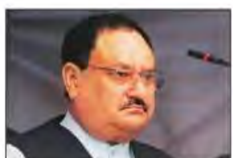
No provocative remark or statement, he said

In a meeting with national office bearers Thursday evening,