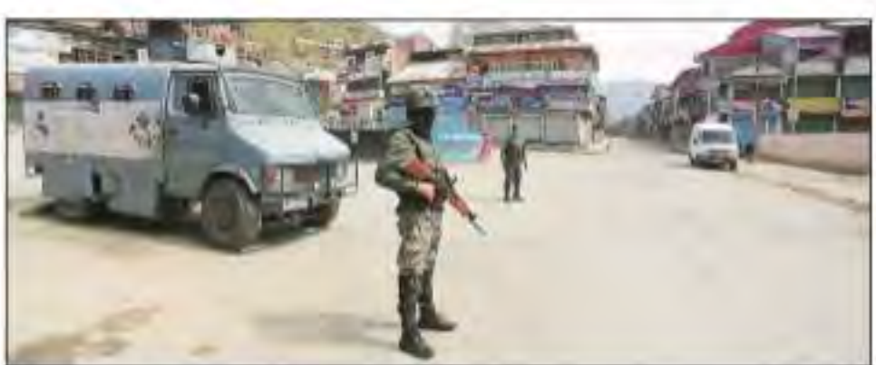
Lockdown at Bandipora in north Kashmir. Shuaib Masoodi

protections for level 4 jobs with a pay scale not exceeding Rs 25,500.