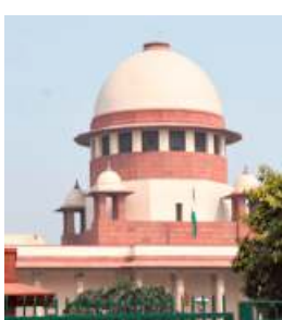
The Supreme Court has listed the case for April 7.

The Supreme Court on Friday ordered the Centre, Kerala and Karnataka to confer immediately and "formulate parameters for passage of patients for urgent medical treatment at the interstate border at Talapadi". The order by a Bench of Justices L. Nageswara Rao and Deepak Gupta came on a series of petitions highlighting Karnataka's blockade of the border. The blockade, the court was informed, had resulted in deaths as ambulances bound for Mangaluru (in Karnataka) were not being permitted to cross the border. The court listed the case for hearing next on April 7. The order came on petitions to facilitate the free movement of vehicles carry-