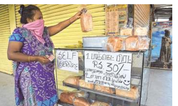
Assured supply: A customer collecting bread from the self-service counter of a shop in Coimbatore.