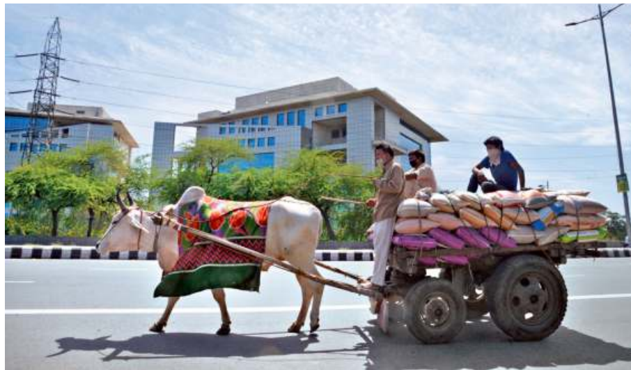
In the slow lane: Essential commodities being transported on a bullock cart in New Delhi on Friday, amid the lockdown restrictions.