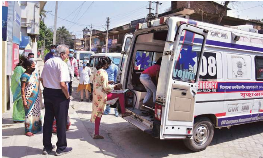
Relatives of a person, who was detected Covid-19 positive in Guwahati's Spanish Garden residential complex, being taken to a quarantine centre in Assam