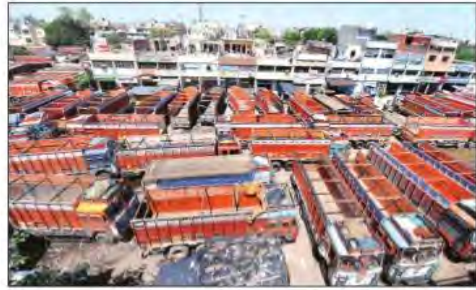
Trucks at Azadpur Mandi during the lockdown in New Delhi on April 2. Many trucks are stranded across the country since March 15, when states started to lock their borders.

With hundreds of trucks getting stranded across the country since March 15, when states started to lock their borders down culminating into a national