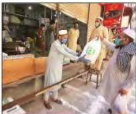
In Peshawar, Saturday.

He said that he was not blaming any government or a group or levelling any allegation or endorsing any media report. However, he added, he had drawn Guterres' attention to apprehensions being shown by the international media.