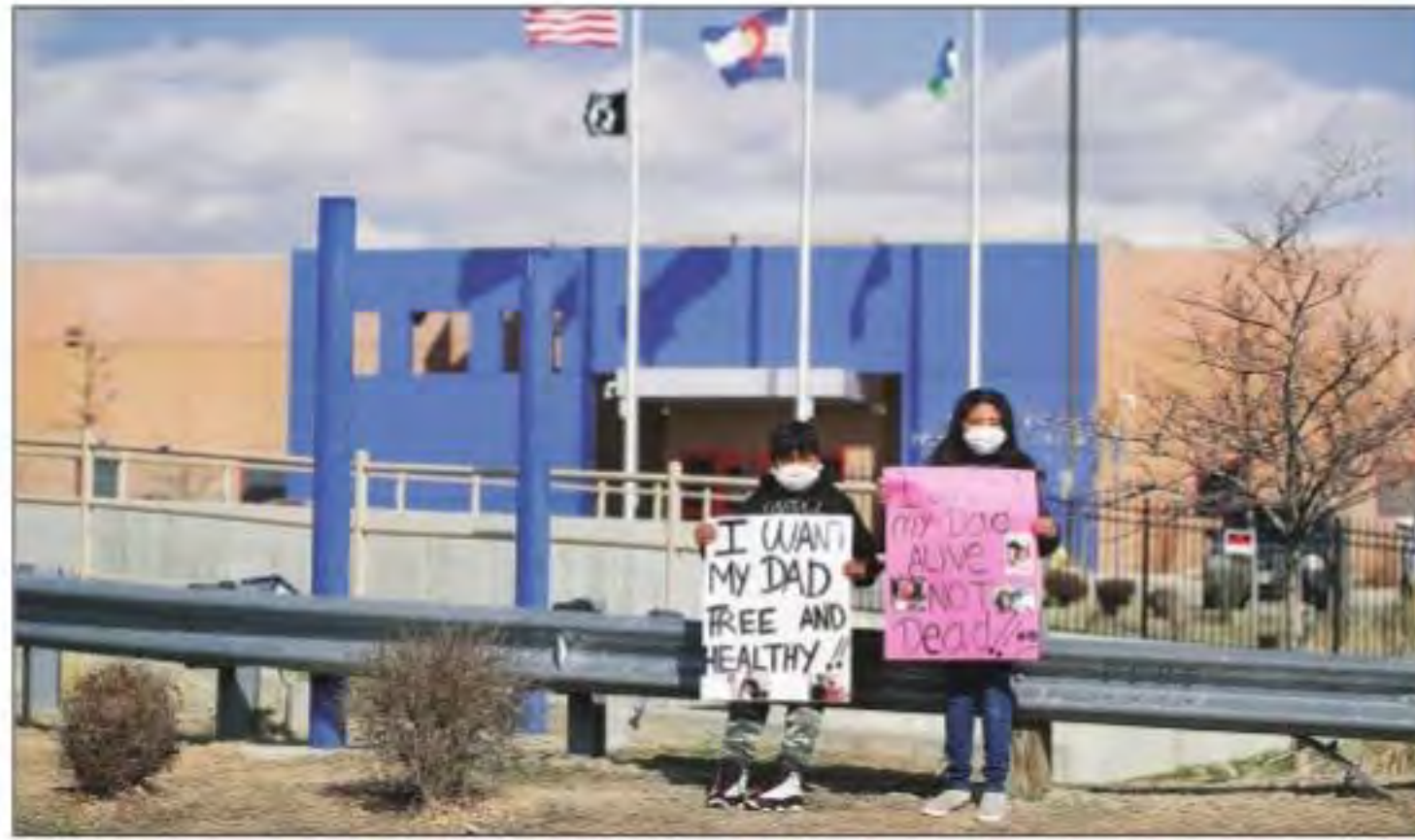
A protest to call for the release of detained immigrants in Colorado, citing the pandemic.

ing the use of medical-grade or surgical-grade masks. Those needs to be used for medical people working to save lives of Americans," he said.