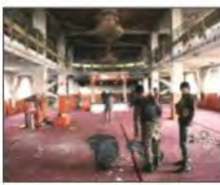
At least 25 people were killed in the attack.

Speaking on condition of anonymity, an NDS official told