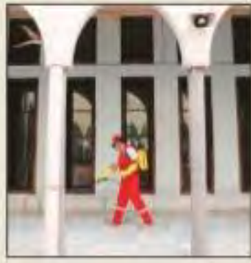
In Dhaka.