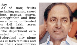
THE DEPARTMENT has estimated that 1.2 lakh metric tonnes of mangoes and sweet limes are required for consumption in the state. THE HORTICULTURE and marketing departments have been procuring fruits.

Deccan Correspondent Hyderabad, April 4 In view of Chief Minister K. Chandrashekar Rao's appeal to the people to consume fruits to improve immunity, the horticulture department is taking steps to supply fruits through 3,500 mobile rythu bazaars in the city. The department has estimated that 1.2 lakh metric tonnes of mangoes and sweet limes are required for consumption in the state. The horticulture and marketing departments have been procuring fruits and the stocks have been transported to various places across the state, including Hyderabad, with support of district collectors and police.