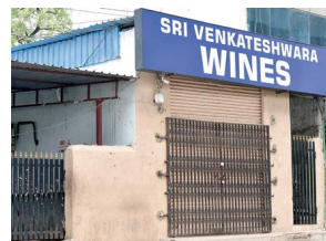
The wine shop in Bhoiguda near Gandhi Hospital which was looted on Saturday.

Thieves and tipplers, desperate to get a high, are resorting to looting wine shops under the Greater Hyderabad Municipal Corporation (GHMC) limits. In the last few days, three wine shops were looted and an unsuccessful attempt made to rob a fourth one. The Telangana Wine Dealers' Association (TWDA) was forced to bring this issue to Hyderabad police commissioner's notice.