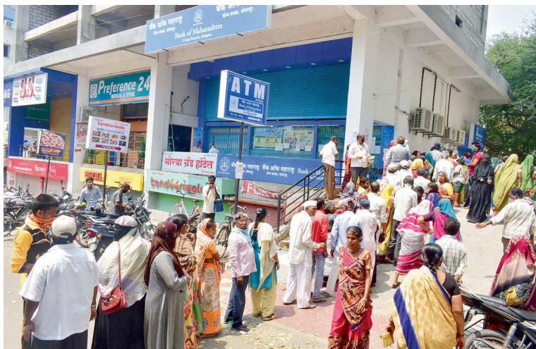
People stand in a queue outside a bank during the nation-wide lockdown in the wake of the coronavirus outbreak in Solapur on Saturday. - PTI

He says all arrangements are in place at the government hospital to deal with any coronavirus eventuality. - PTI