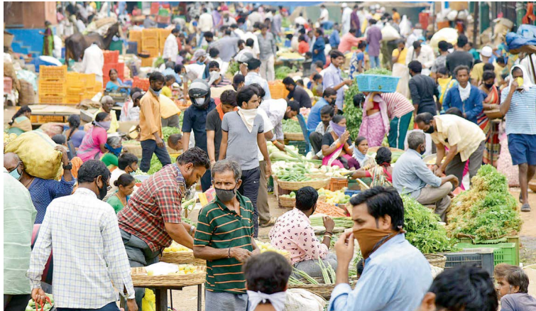
A large number of customers buy vegetables and other essential items amid a nationwide lockdown at the Monda market without maintaining social distance, crucial to control the spread of Covid-19, in Secunderabad on Saturday. — S. SURENDER REDDY