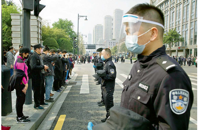
People and policemen bow their heads during a national moment of mourning for victims of coronavirus in Wuhan in central China's Hubei Province, on Saturday