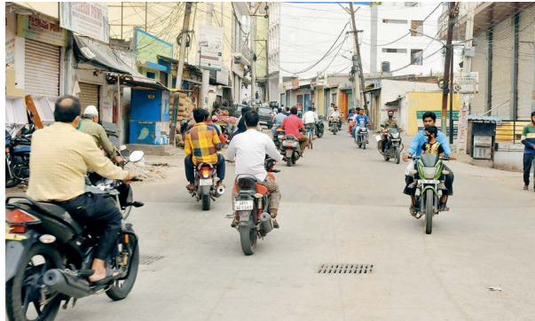
People moving around the city without following any restrictions despite the continuation of lockdown.

POLICE SAID MR PRAVEEN WAS POST NEAR AN ATM KIOSK WHEN HE CAME UNDER ATTACK FROM THE DUO THAT WAS WEARING MASKS AND CAME ON A TWO-WHEELER. THEY QUICKLY ESCAPED.