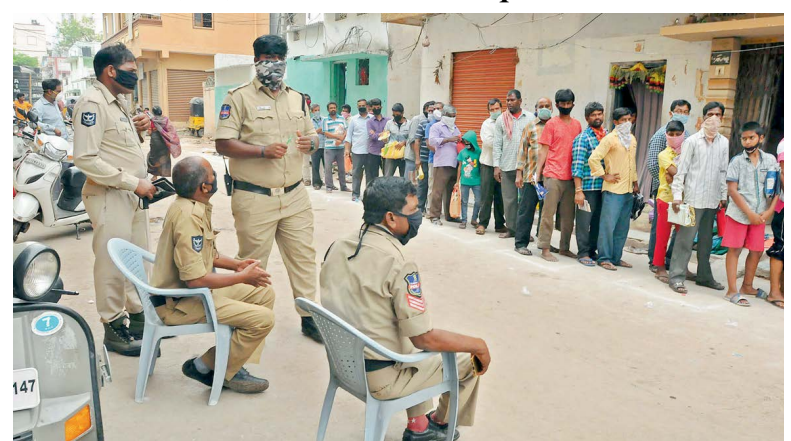
Police helplessly watch as people ignore social distancing norms at Malakpet Palton for free ration being supplied at Government Fair Price shops on Saturday. With servers down for a significant amount of time, there were lot of arguments with the police and Fair Price shop owners.