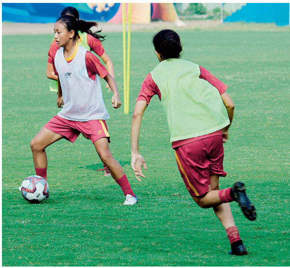
The Indian Under-17 women's team attend a training session in this file photo.

New Delhi, April 4: The FIFA Under-17 Women's World Cup to be held in India in November was on Saturday postponed by football's governing body due to the worsening Covid-19 pandemic across the globe.