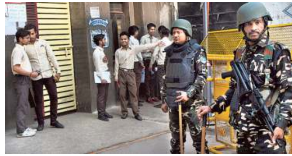
Students outside a school at Jaffrabad as security personnel keep vigil after the riots.