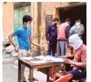
Several ration shops were found to be shut due to supplies running out.

In a letter to Chief Minister Arvind Kejriwal, the Delhi Roti Roti Adhikar Abhiyan (DRAA) has urged the State government to ensure transparency and accountability in distribution of ration in the city.