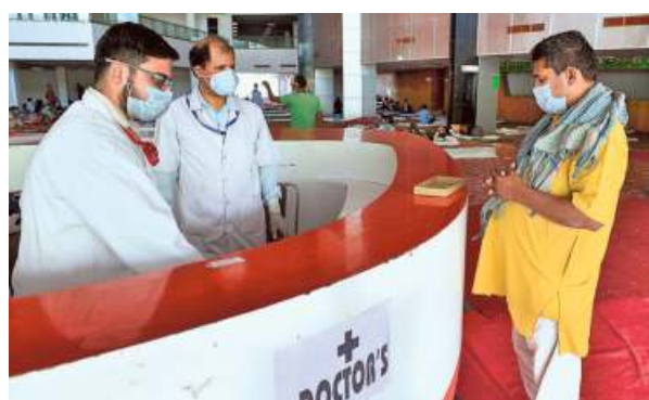
The hospital did not disclose further details about the case.

As many as 108 employees of Sir Ganga Ram Hospital (SGRH) here, including doctors and nurses, have been quarantined after they came in contact with two patients who have tested positive for COVID-19, said authorities on Saturday.