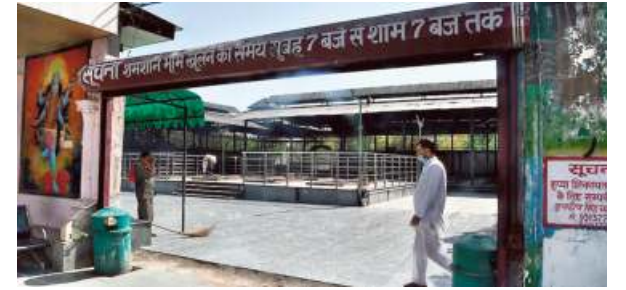
The Punjabi Bagh crematorium in New Delhi on Saturday. SHIV KUMAR PUSHPAKAR

Punjabi Bagh crematorium has decided to send the bodies of those who die of COVID-19 - in case they arrive - straight to CNG machine cremation space and not let them be cremated according to the traditional method.