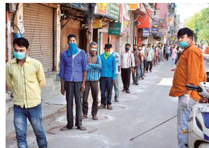
A worker paints a circle outside a PDS ration shop to earmark space for consumers for maintaining social distancing in Geeta Colony; shoppers at Azadpur Sabzi Mandi; men wait in queue to get food in Laxmi Nagar during the ongoing lockdown imposed as a preventive measure against the spread of COVID-19, on Saturday morning in the city.