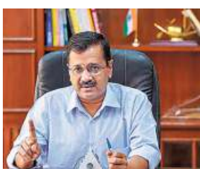
Chief Minister Arvind Kejriwal said children should be told about the nature of the virus.

“If we talk about Delhi, 44 lakh students are studying in schools, including civic bodies, private and government ones. As a result of the lockdown, children are at home. It is very important to understand how to sail through these tough times. The aim is to effectively utilise our time and that is why