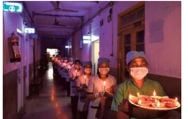
United effort: Nurses of J.N. Ray Hospital in Kolkata expressing solidarity in the fight against the pandemic.

Harsh Vardhan lit a lamp along with AIIMS doctors and staff, whom he called "Corona warriors", on the Delhi campus.