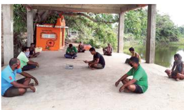
Keeping informed: Villagers tuning in to a community radio station in Odisha.

"We deliberately did not utter the word quarantine as it causes panic. We just urged migrant labourers to go to panchayat offices and inform them of their arrival. Our approach clicked. According to the feedback we have received, most of them went and disclosed