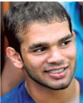
Narsingh. ■ FILE PHOTO: PTI

"But our schedule will depend on the international calendar. We have to see if UWW will hold the World championships before the