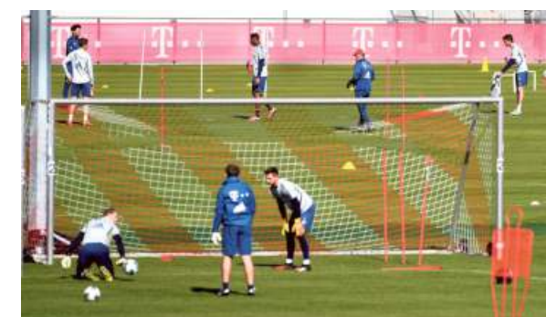
Welcome sight: Bayern Munich players train in small groups at the Saebener Strasse complex on Monday.