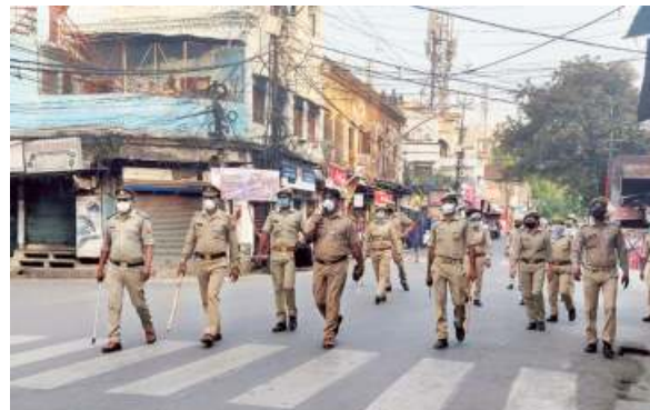
Flag march: Police personnel in Lucknow asked people not to crowd outside.

The government listed 100 such hotspots spread across 15 districts, including Lucknow, Noida, Ghaziabad, Agra, Varanasi and Meerut. The actual names were still trickling in till late on Wednesday evening. The district-wise hotspots to be sealed