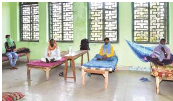
A file photo of migrant workers lodged in a government-run shelter home in Patna. RANJEET KUMAR

more than 1.7 lakh people had returned to the State in the wake of the lockdown, and as many as 27,300 of them had been lodged in these quarantine centres opened in different districts.