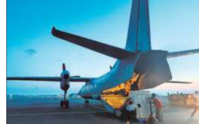
An IAF aircraft ferried medical equipment from Chennai to Bhubaneswar on Monday for setting up COVID-19 testing facilities in Odisha.

was facing an unprecedented challenge, in which "we are getting cases of both symptomatic and asymptomatic patients acting as carriers. The need of the hour is to break the transmission, and for that, the lockdown is the key, and we seek the cooperation of people."