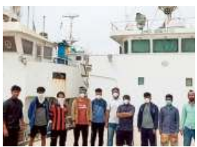
A file photo of seafarers stuck in Iran.

As per government estimates, there were "16,000-17,000" seafarers who need to be brought back to the country. "How they are brought back will depend on the Government of India's policy on allowing people to come from outside. Whatever policy is finalised, the same will be followed in the case of the seafarers. We will wait for the policy to be